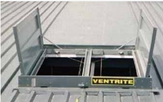
INFERNO SMOKE VENTILATOR