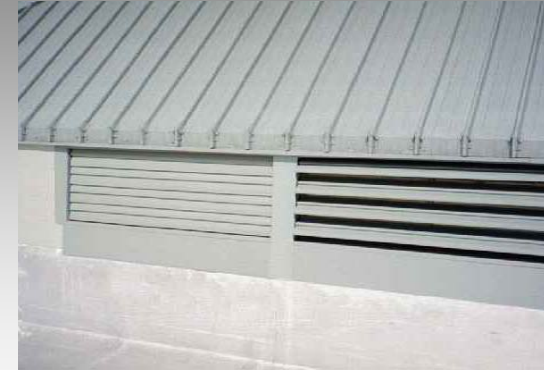
FIXED & ADJUSTABLE LOUVRES