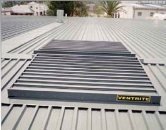
FIRE FORCE LOUVRED VENTILATOR