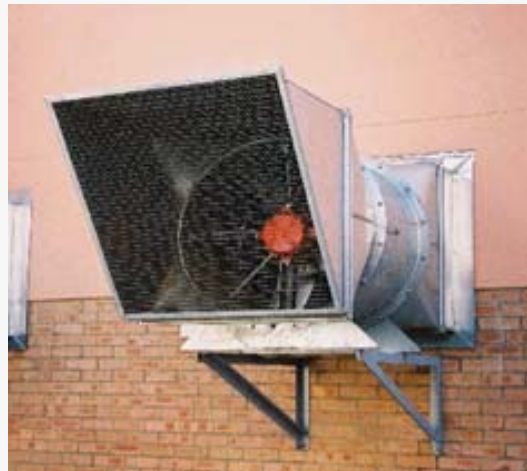
MECHANICAL SMOKE EXTRACTORS