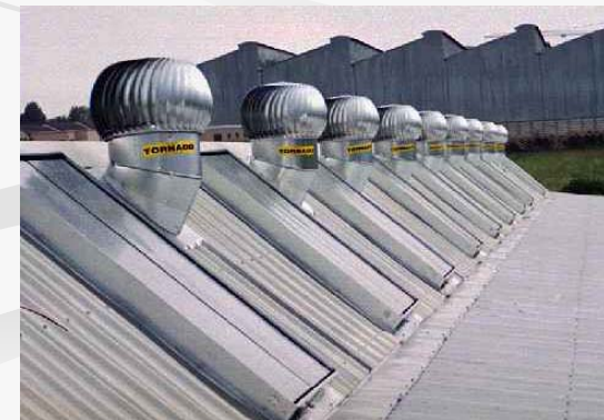
TORNADO TURBINE VENTILATORS