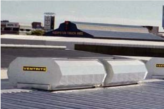
FIRE FLAIR SMOKE & NATURAL VENTILATOR